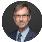
CLAY GRUBB LINK APARTMENTS